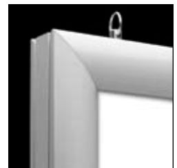
DOUBLE-SIDED CURVED FRAME