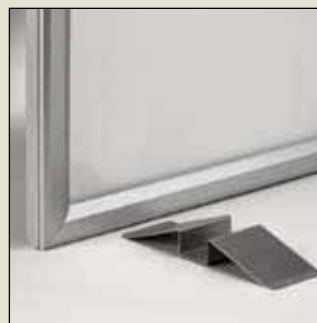
ELEGANT DISPLAY BASE