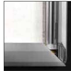
FRONT LOADING GRAPHICS