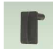
Shown actual size